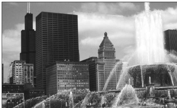
Buckingham Fountain, Chicago, Ill.

Description: Local delivery methods for adjuvant therapy of intrinsic brain tumors have evolved from experimental studies into standard of care treatment. In this practical update a wide range of local delivery modalities will be discussed including polymers, convection, blood brain barrier disruption, endovascular techniques and local delivery of radiation. Practical examples of clinical applications for each of these methods will be reviewed, and the current status of experimental therapies in clinical trial will be discussed. At the conclusion of the course, participants will have a refined understanding of what delivery methods are currently available for standard of care treatment, and what methods are currently in later stages of clinical development. A review of clinical trial results, ongoing clinical trials and centers of participation will be provided as well.